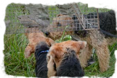
Airedales meet a game bird in a Beginner's Workshop