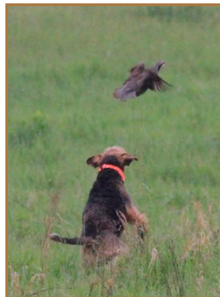
Why? Because its worth it....

You may decide that field training is a lot of time and effort, and its just not for you. BUT you may be surprised to find that you and your Airedale are really enjoying this hobby and the time together outdoors. This will be especially true if your Airedale shows you this is the sport he'd most love to spend his time on. If you start out in training-isolation with your Airedale, you're in the spot that many of us started from. If you take the initiative to make your training connections, you'll have as much of a chance to have a great hunting companion dog as the does any guy starting out with a Lab or a Golden.