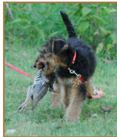
We all start out as a pup.

Why is all this important? The founders of HWA understood that Airedales were developed as an all-purpose three-in-one hunting dog (fur/ upland game/ waterfowl). They knew that hunting heritage was integral to the breed and could only be preserved if Airedales continued to be used as hunting dogs. Having Airedales compete with traditional sporting dog breeds in hunt tests designed to measure standards of performance proves to the sporting dog world that Airedales still have a place in the field.