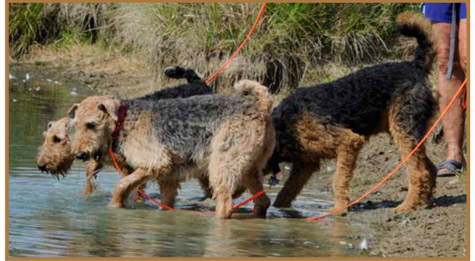
Evaluating Airedales' inclination to enter water in a Hunting Instinct Test.