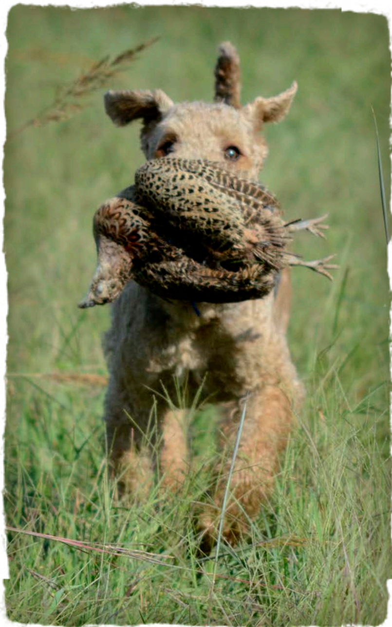
Here comes Trouble.

Long may Hunting Working Airedales continue!