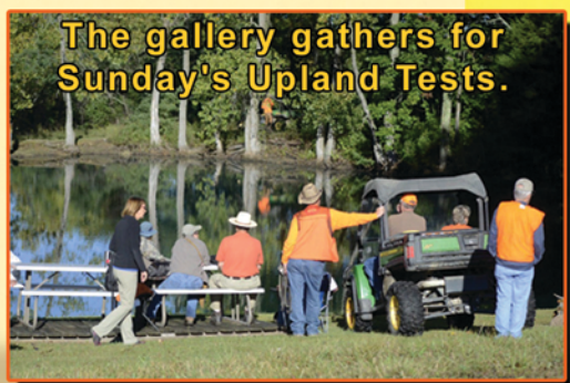
The gallery gathers for Sunday's Upland Tests.