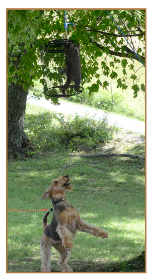
Jake, owned/handled by Lillian Elliott, enjoys the Barkathon.

The Junior Test dogs ran a 100 yard track in a different scenario and location. Their track went through tall grass up a hillside towards a clump of trees behind a hedgerow. Three of the eight Juniors qualified in this test. You'll find a complete list of all qualifiers at the end of this article.