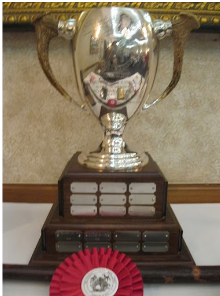
Joan Shea Gordon Memorial Award