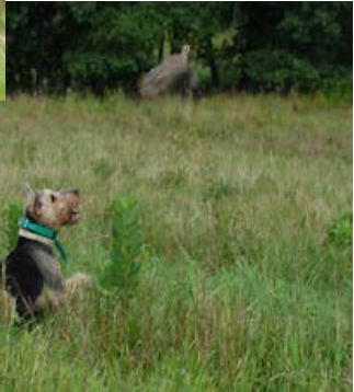
Hilltop's Sunshine Future Hunter