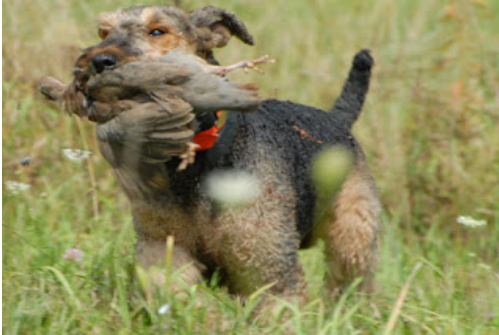
Hilltop's Filson: AKC Master Hunter, 2017