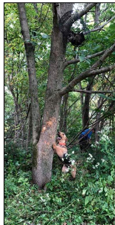
Sassy at the Fur Tree