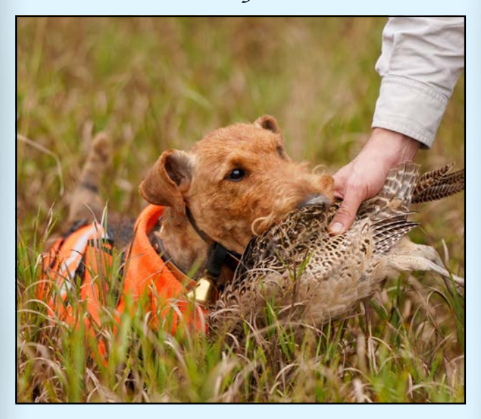
Timberwyck Vesper Shaken Not Stirred