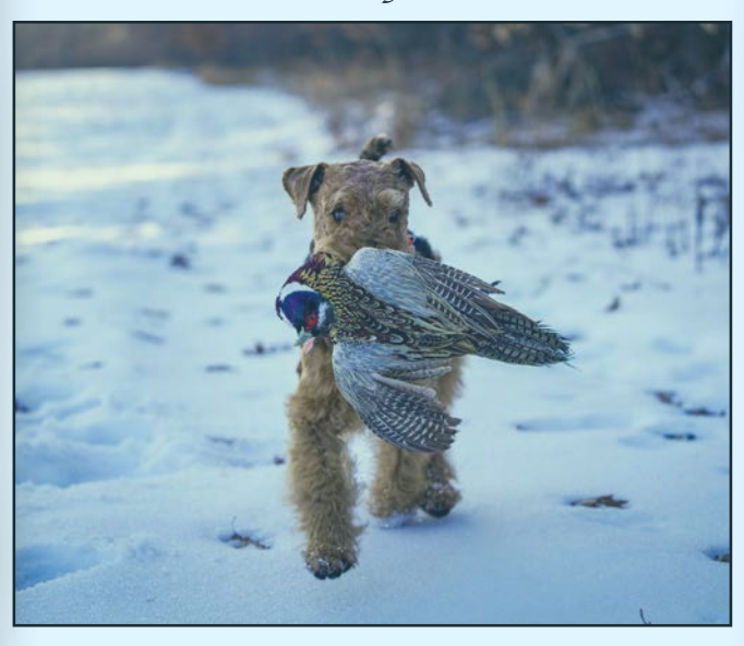
GCH Coldstream Major Mischief Second to None, JFT, CGC, TKI