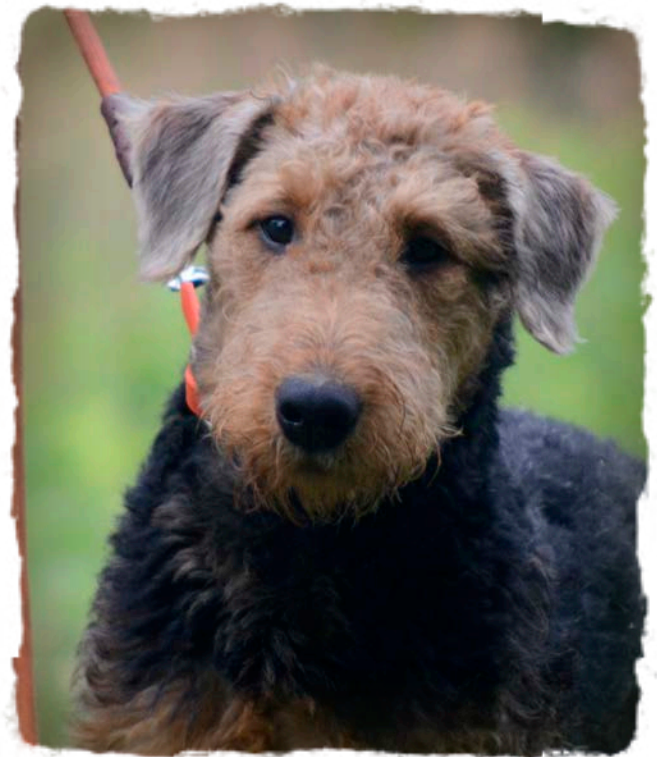
Their future is in your hands.

But this begs the question, How about you? If you have already renewed or started your 2024 HWA membership – thank you! But if you've been admiring hunting/working Airedales from afar, we ask you join in their preserving and promoting by becoming an HWA member. In a world full of "good causes" seeking your support, we'd suggest the HWA is a good cause for you even if you can't come to events. You can find HWA's 2024 Membership form as the last page of this newsletter. Its also available on our website via this link https://www.huntingworkingairedales.com/files/ugd/57083b_fdaaf0ccb8544f1ab1b4d42cf4f0e0eb.pdf