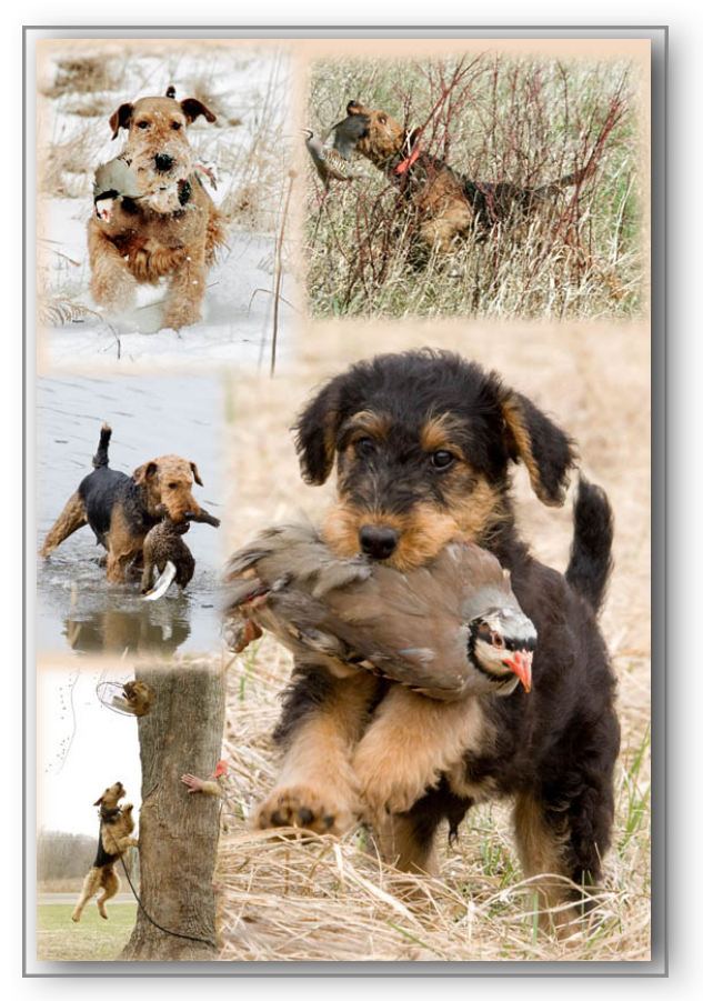
Poster for the ATCMNY Airedale Booth at Meet the Breeds in NYC

Airedales are well-represented by members of the Airedale Terrier Club of Metro New York (ATMNY). Club members not only bring their Airedales to meet and greet the public, they also educate and advocate for our breed. Airedale hunting heritage and abilities are shown off by a hunting poster, with HWA brochures offered at the booth. Our appreciation to members of the ATMNY for showcasing our versatile breed. For more information on Meet the Breeds see https://www.akc.org/sports/meet-the-breeds/