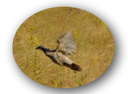
Gunners' Certification Seminar Being Considered

Do you hunt over your dog? Do you own a break-open shotgun (12 gauge preferred) that you're very fond of using? Are you a good shot?